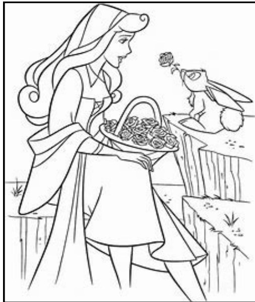
Colour me in!

PLAIN GRILLED CHICKEN & STEAMED GREENS 6